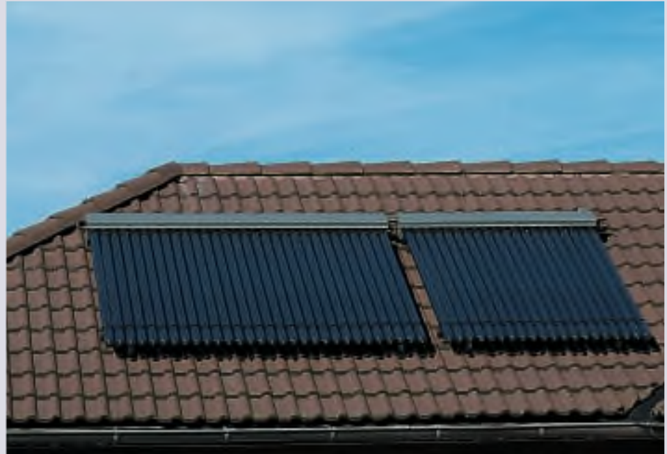
Vitosol 300 – Solar heating system with 54 ft 2 / 5 m 2 collector surface area