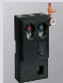
Solar-Divicon pump station