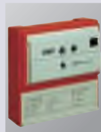
Solartrol-M control unit