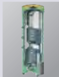
Viticell-B 300 Hygienic stainless steel domestic hot water tank with two separate heat exchanger coils