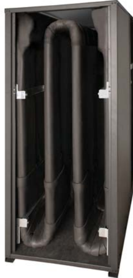
Extended range insulated water/refrigerant circuit standard