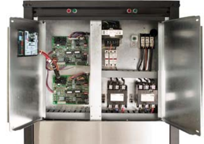
Advanced digital controls with Remote Service Sentinel and compressor "run" and "fault" LED. Optional Enhanced controls (DXM) & DDC Controllers