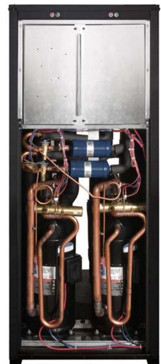
Dual compressor refrigeration circuit