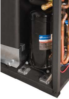
Copeland scroll compressors with dual-isolation mounting for quiet operation