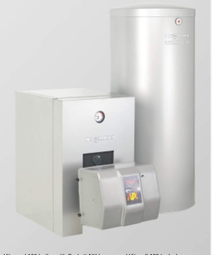
Vitorond 100 boiler with Beckett NX burner and Vitocell 100 tank shown.

Space-saving, compact design, clean finish